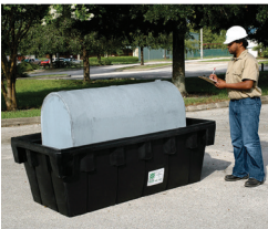
ULT2800 Ultra-275 Containment Sump Without Drain

Eliminate costly spills while storing fuels, oils and other hazardous liquids. Rugged, all-polyethylene construction will not rust or corrode. Meets EPA Container Storage Regulation 40 CFR 264.175 and SPCC regulations. Helps comply with NPDES, 40 CFR 122.26 (1999).