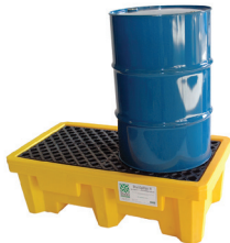
ULT1011 Ultra-Spill Pallet P2, 2 Drum, With Drain

Specially constructed to support heavy loads and designed to be easily used and transported. 100% Polyethylene construction makes it compatible with a wide range of chemicals, while its low-rise, 11 inch walls give more accessibility for pouring.