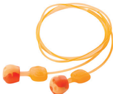
TRUSTFITPOD30 Earplugs TrustFit Pod Corded Push-In

3M Designed with an ergonomic stem, and dimpled foam tip so they are easy to fully insert and remove without picking up dirt from workers' fingers. Comfortable enough to wear all day. TrustFit Pod push-in foam earplugs provide effective NRR 28dB, Canada Class A(L) hearing protection.