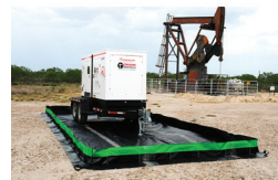
ULT8403 Ultra-Containment Berm, Collapsible Wall Model, 6' X 6'

The Collapsible Wall Ultra-Containment Berm features an economical design that sets up quickly and provides secure containment. PVC Sidewall Assemblies provide sturdy support for the containment area but are quickly lowered easy access.