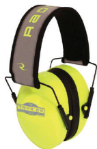
RADTR0HVG-BX Radians TRPX™ Hi-Viz 29 Earmuff, Hi-Viz Green RADTR0HVO-BX Radians TRPX™ Hi-Viz 29 Earmuff, Hi-Viz Orange

RADIANS Premium, lightweight earmuff provides excellent protection with superior comfort. The bright, hi-viz ear cups provide excellent visibility during the daytime, and the reflective material on the headband provide visibility at night. Noise Reduction Rating (NRR) 29dB.