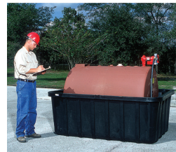
ULT2823 Ultra-550 Containment Sump Without Drain

Eliminate costly spills while storing fuels, oils and other hazardous liquids. Rugged, all-polyethylene construction will not rust or corrode. Meets EPA Container Storage Regulation 40 CFR 264.175 and SPCC regulations. Helps comply with NPDES, 40 CFR 122.26 (1999).