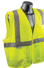
MSV2GM SV2 Economy Class 2 Vest

Compliance at an economical price. Excellent choice for extreme work environments like asphalt paving that greatly reduce the useful life of a vest, or protection for short-term labor. Hook & loop closure, 2" silver tape reflective material and 1 horizontal stripe. 100% polyester mesh in hi-viz green.