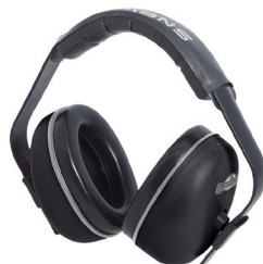
RADEL23-B Radians Eliminator™ 23 Earmuff

Lightweight, comfortable earmuff with a padded, adjustable headband. Noise Reduction Rating (NRR) 23dB