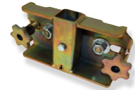
Nelson Stud Stanchion Base

Receiver and tie-back brackets are designed to clamp directly to Nelson Studs. Brackets are designed to allow enough space on beams to allow decking panels to be flown in to place without interference from brackets.