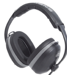
RADEL26-B Radians Eliminator™ 26 Earmuff

Lightweight, comfortable earmuff with a padded, adjustable headband. Noise Reduction Rating (NRR) 26dB.