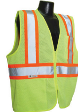
MSV222G SV22-2 Economy Class 2 Vest with Two-Tone Trim

Compliance & protection at an economical price. Excellent choice for extreme work environments like asphalt paving that greatly reduce the useful life of a vest, or protection for short-term labor. Reflective stripes on contrasting trim make workers much more noticeable in low light and broad daylight.