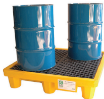
ULT1001 Ultra-Spill Pallet P4, 4 Drum, With Drain

Specially constructed to support heavy loads, and designed to be easily used and transported. Its 100% Polyethylene construction makes it compatible with a wide range of chemicals, while its low-rise, 11 inch walls give more accessibility for pouring.