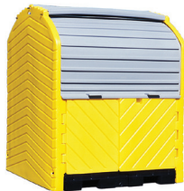
ULT9637 Ultra-Hard Top P4 Plus, 4 Drum, With Drain

The Ultra-Hard Top Plus Spill Pallet provides a safe, convenient and effective place to store up to four 55-gallon drums. The roll-top doors above and swing out doors below provide complete and easy access to the inside spill containment area.