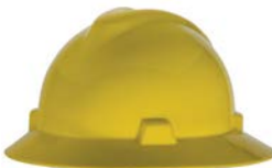
MSA454730 V-Gard® Slotted Protective Hard Hat

The MSA V-Gard Helmet, with its distinctive trademark "V" design, is a world recognized brand known for comfort, quality, and durability.