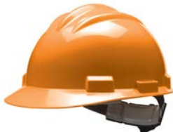
BULS61RHO Low Profile Hard Cap, Orange

The Bullard S61 sports a low-profile shell design and upgraded features and benefits. Comes with a 4-point suspension system and absorbent, cotton brow pad.