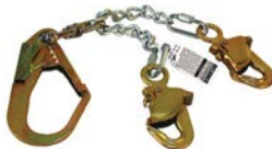
REL726001 Aluminium Rebar Chain Assembly

14" chain assembly with two 7/8" opening Pelican™ snap hooks and one 2 1/4" opening steel rebar hook.