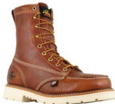
TG4308 8" American Heritage Safety Toe Work Boot, Tobacco

When the job conditions are rugged, these safety toe boots keep your feet out of harm's way. The Goodyear Welt construction means you can resole these shoes over the years, making these Made in the USA boots a smart buy.