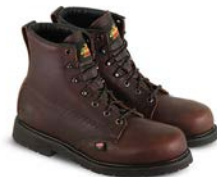
TG3406 6" Oil Rigger Safety Toe Work Boot, Brown

The rugged Oil Rigger boots from Thorogood have you covered. The Vibram® SO498 rubber outsole with TC4 compound is slip-resistant and highly abrasion resistant – great for oil and gas or welding applications.