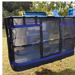
TUTMLS228J JLG Man DOPS Lift Enclosure With Right Hand Entry, 36" x 96"

The TUTUS Dropped Object Prevention Solutions™ (D.O.P.S.™) provides an extended level of protection to lift platforms by containing tools and material within the platform using a durable lightweight mesh enclosure.