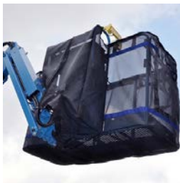
TUTMLS226J JLG Man DOPS Lift Enclosure With Right Hand Entry, 36" x 72"

The TUTUS Dropped Object Prevention Solutions™ (D.O.P.S.™) provides an extended level of protection to lift platforms by containing tools and material within the platform using a durable lightweight mesh enclosure.