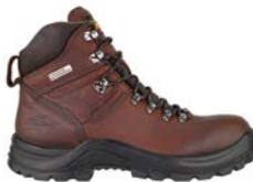
TG8043266 6" OMNI Waterproof Safety Toe Work Boot, Brown

The waterproof, breathable lining in these safety toe boots means your feet won't get wet. Thorogood's lug outsole offers reliable traction, while bob lugs flex like independent claws on contact with hard surfaces.