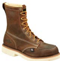
TG4378 8" Steel Moc Toe Work Boot, Brown

This 8" Moc Toe work boot features a trail crazyhorse leather upper, Goodyear storm welt construction and removable dual-density Ultimate Shock Absorption™ footbed on Poron® comfort cushion insole.