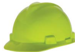
MSA10061512 V-Gard Slotted Protective Cap, Hi-Vis Green

MSA V-Gard® Class E Polyethylene Slotted Hard Cap With Fas-Trac® Suspension has self-adjusting crown straps for added comfort protection. Lightweight cap is designed to work with MSA accessories and polyethylene shell offers superior impact protection.