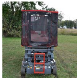
TUTSLS4632 Skyjack Scissor Lift System Platform, Extension Deck 4', 42" x 84"

The TUTUS Dropped Object Prevention Solutions™ (D.O.P.S.™) provides an extended level of protection to lift platforms by containing tools and material within the platform using a durable lightweight mesh enclosure.