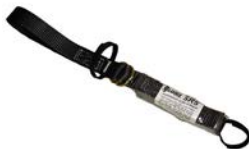
REL884000 SRS Suspension Relief Stirrup

The Suspension Relief Stirrup (SRS) is designed to provide the user relief from suspension after a fall arrest has occurred. Medsafe recommends the use of two (one for each foot/leg) REL884000's for better support and suspension relief.