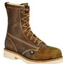
TG4379 8" Steel Plain Toe Work Boot, Brown

This 8" Steel Toe work boot features a trail crazyhorse leather upper, Goodyear storm welt construction and removable dual-density Ultimate Shock Absorption™ footbed on Poron® comfort cushion insole.