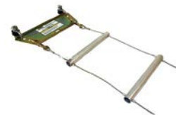
REL5220 Wire Rope Rescue Ladder, 20'

Wire Rope Ladder for Horizontal Lifeline rescue (#5200 bracket not included)