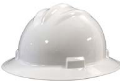
BULS71RWH Low Profile Full Brim Hard Hat, White

The Bullard Model S71 is a full brim hat offered with a ratchet suspension which features a replaceable cotton brow pad. The suspension system has four points of attachment with four separate keys for a secure fit.