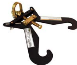
REL3040 LockJaw™ Remote Beam Grip Clamp

Remote Beam Grip. Attaches easily to I-Beams, 5"-12" flanges. Mounts using fiberglass pole with 20 ft. reach 10,000 lb. (two-man) anchorage point. Aluminum jaws, steel swivel. For overhead anchorage use only.