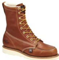
TG4208 8" Steel Moc Toe Work Boot, Tan

This 8" Moc Toe work boot features a tobacco oil-tanned leather upper, Goodyear Storm Welt construction and cotton drill vamp lining.