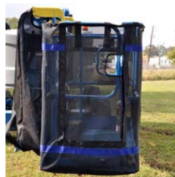
TUTDUAL226J JLG Man DOPS Lift Enclosure With Console Entry & Right Hand Entry, 36" x 72"

The TUTUS Dropped Object Prevention Solutions™ (D.O.P.S.™) provides an extended level of protection to lift platforms by containing tools and material within the platform using a durable lightweight mesh enclosure.