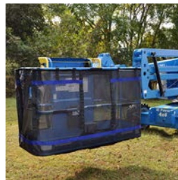
TUTMLS228G Genie Man DOPS Lift Enclosure With Center Drop Bar Entry, 36" x 96"

The TUTUS Dropped Object Prevention Solutions™ (D.O.P.S.™) provides an extended level of protection to lift platforms by containing tools and material within the platform using a durable lightweight mesh enclosure.