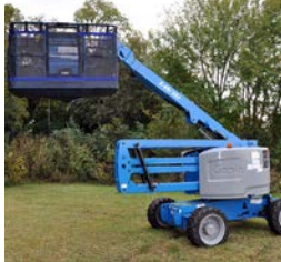
TUTDUAL226G Genie Man DOPS Lift Enclosure With Drop Bar Entry & Left Hand Entry Door, 36" x 72"

The TUTUS Dropped Object Prevention Solutions™ (D.O.P.S.™) provides an extended level of protection to lift platforms by containing tools and material within the platform using a durable lightweight mesh enclosure.