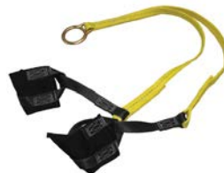
REL722001 Rescue Wristlets

Designed for confined space extraction. Straps can be fitted over wrists or ankles.