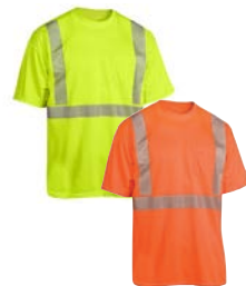
RADLHV-XTS-AR-P Original Breezelight™ II Class 2 T-shirt, Hi-Viz Lime

Cool mesh with PFM technology. High performance. High quality premium fabric. High wicking moisture management. Compliant & certified to 75 washes. Meets ANSI 107-2010 high visibility standards.